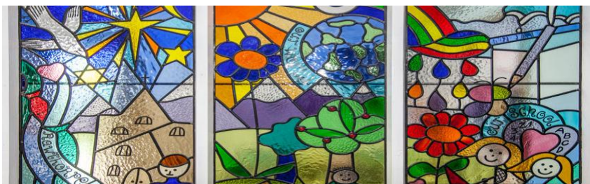
Learning together in God's Love